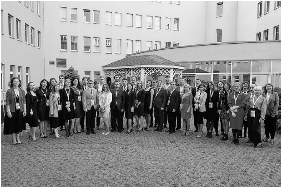
Летняя Школа по международному публичному праву 2019 года Summer School on Public International Law of 2019